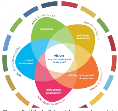
Figure 3: Whole School Approach model