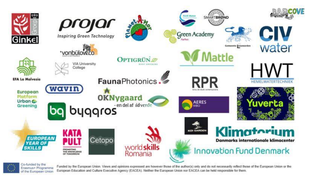
Figure 2: Overview of all organizations involved in the BlueGreen Innovation Challenge 2023